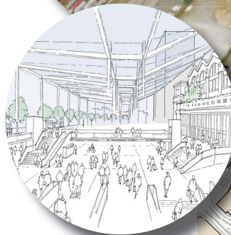
Conceptual Sketch & Plan