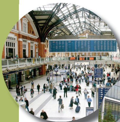
Inspiration: Liverpool St. & Canary Wharf