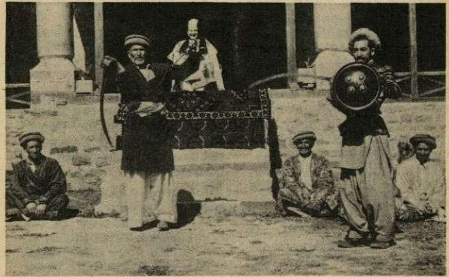
"Happy Kingdom of Hunza", which has no crime rate or sickness, will be among themes featured on TV adventure series which begins at 8:30 p.m., Tuesday, August 7 on Channel 8.

Vol. 47 Vancouver, B.C., Friday, July 27, 1962 No. 30