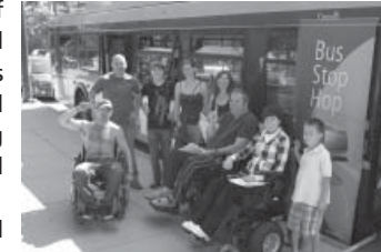
The Langley Lions won the Bus Stop Hop!

For more info or to participate next year, visit www.bcpara.org .