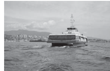
The new SeaBus will launch this December (pending approval from Transport Canada!)

In December, the blog will have the inside scoop on the new SeaBus launch, holiday service reminders, the proposed Canada Line YVR Addfare, and more.