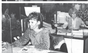
Our call centre in 1959 and 1984!