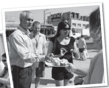
TransLink staff handing out cupcakes to transit riders!

It's been an incredible first year for Metro Vancouver's newest SkyTrain Line—keep up the good work!