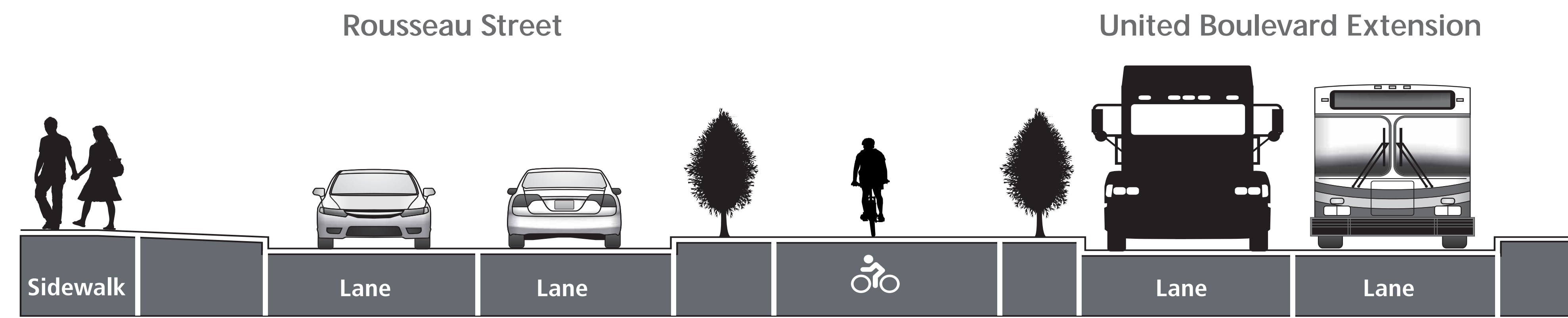
Option C: A cross section view at Rousseau Street