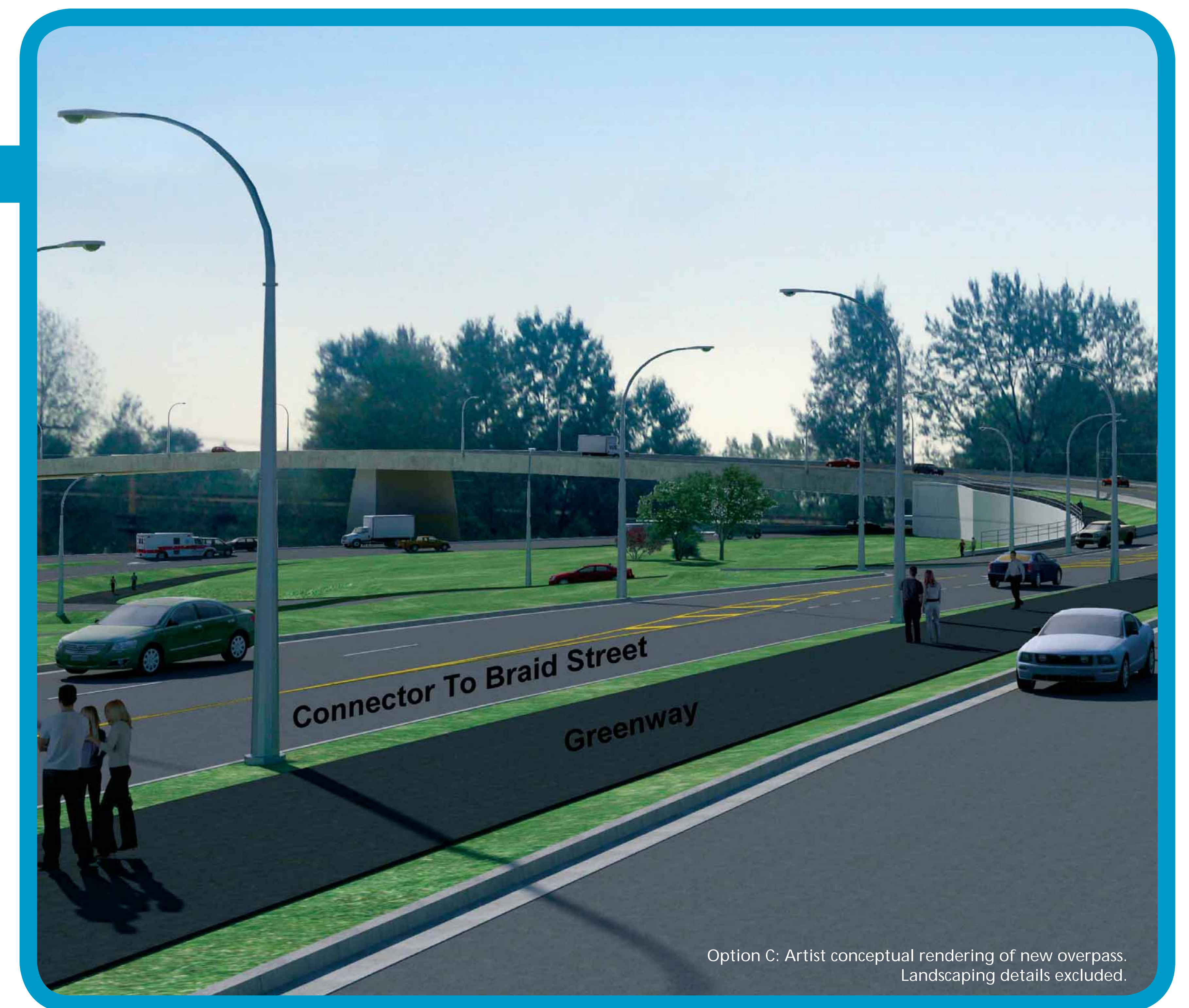
Option C: Artist conceptual rendering of new overpass. Landscaping details excluded.