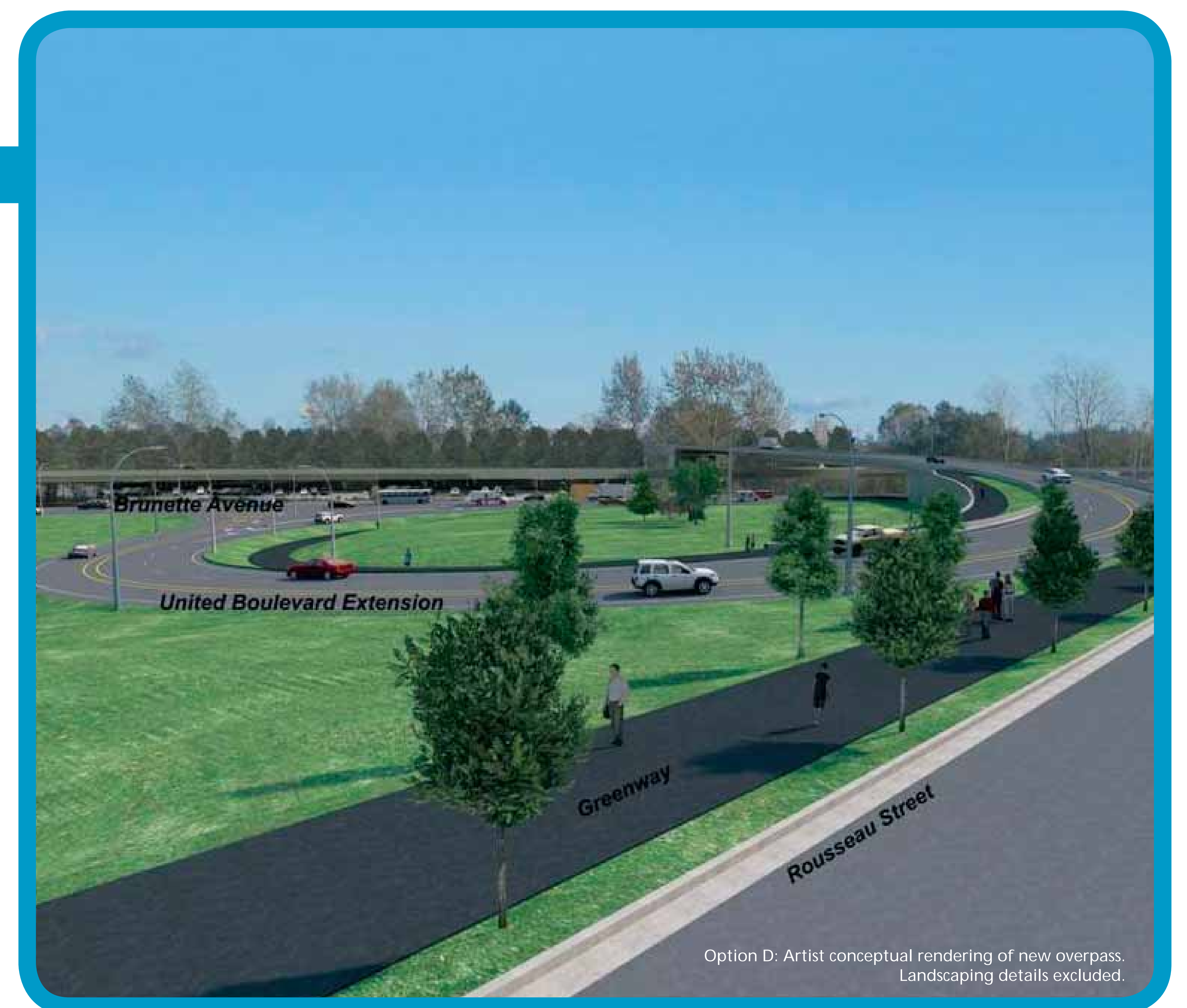
Option D: Artist conceptual rendering of new overpass. Landscaping details excluded.