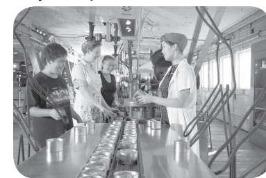
Canning image

a great living museum of times past. You can also stroll along the picturesque wharf, buy stamps at the historic Steveston Museum, fly a kite