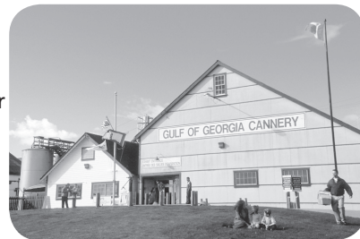
Cannery image courtesy of Parks Canada

or the 410 Railway (on No. 3 Road) bus route. To bike part way from north of Richmond, take your bike on the Canada Line to Richmond Centre station, ride west on Granville Ave, head south on Railway Avenue to Moncton Street and finally head west to No. 1 Road where you'll find yourself in the heart of Steveston.